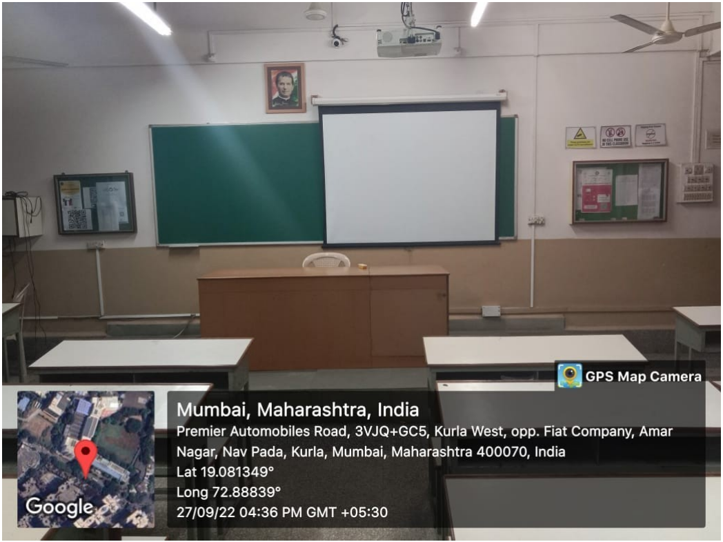
Figure 2: Sample photo displaying projector installed in classroom